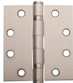
BALL BEARING BUTT HINGE