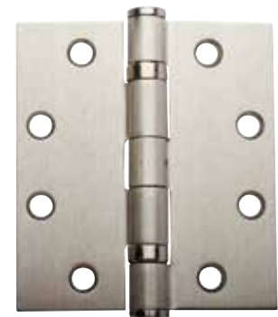
NON-REMOVABLE PIN BALL BEARING BUTT HINGE