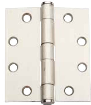
PLAIN BEARING BUTT HINGE